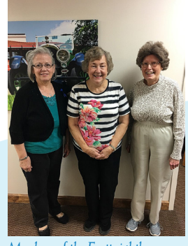
Members of the Forttnightly Musical Club

Designated fund established to benefit the Springfield Museum of Art, Springfield Catholic Central High School and the Springfield Foundation.