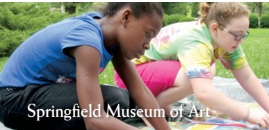
Springfield Museum of Art

Our Mission is to raise, strengthen, and distribute permanent charitable funds to benefit Clark County and the surrounding region.