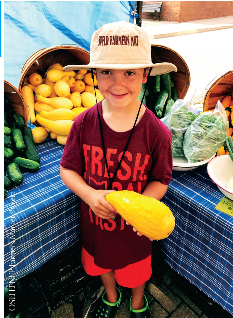
OSUEFED Farmers Market Project

Confirmed in compliance with National Standards for U.S. Community Foundations