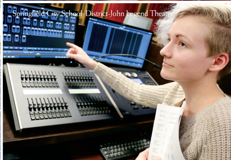
Springfield City School District-John Legend Theater