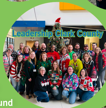
Leadership Clark County