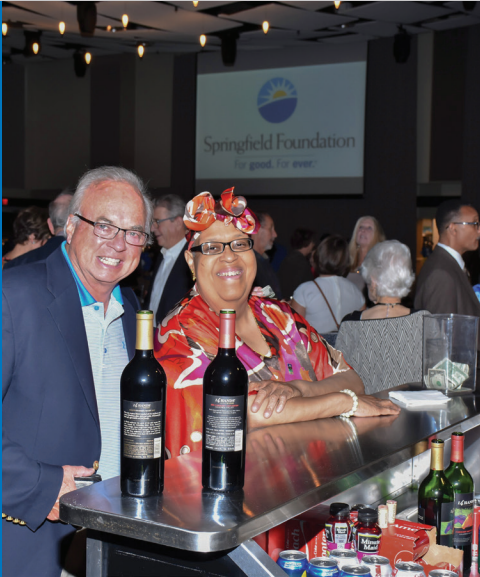
MEMORIES FROM OUR 70TH ANNIVERSARY DONOR RECEPTION, OCTOBER 2018